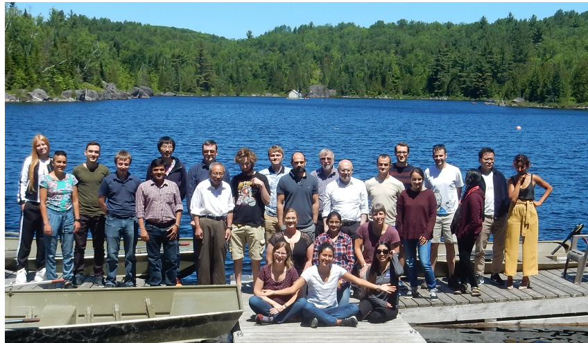
Figure 2: Group photo taken at the 4 th IAGA School

The 4 th IAGA School, prior to the IUGG General Assembly in Montréal, Canada, was held at the Station de biologie des Laurentides (SBL), ca. 80 km NW of Montreal. The School was attended by 20 students, with 5 from Europe (France, Germany, Poland), 3 from Russia, 5 from Asia (India, Japan, China), 6 from North America (USA, Mexico, Canada) and 1 from South America (Brazil). Topics across all the disciplines of IAGA were covered by lectures given by experts in their fields, and both the students and the lecturers gave very positive feedback on the event.