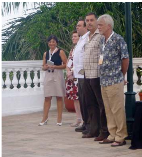
Opening and Award Ceremony