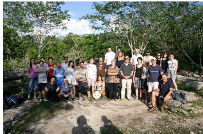
First IAGA school: Students and lectures during the field trip