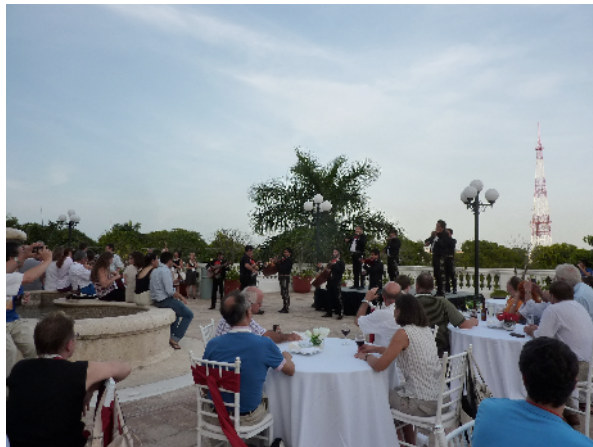
Opening and Award Ceremony