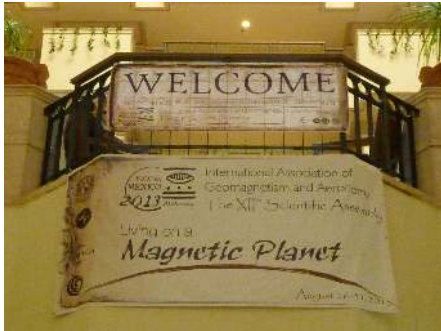
IAGA XII motto