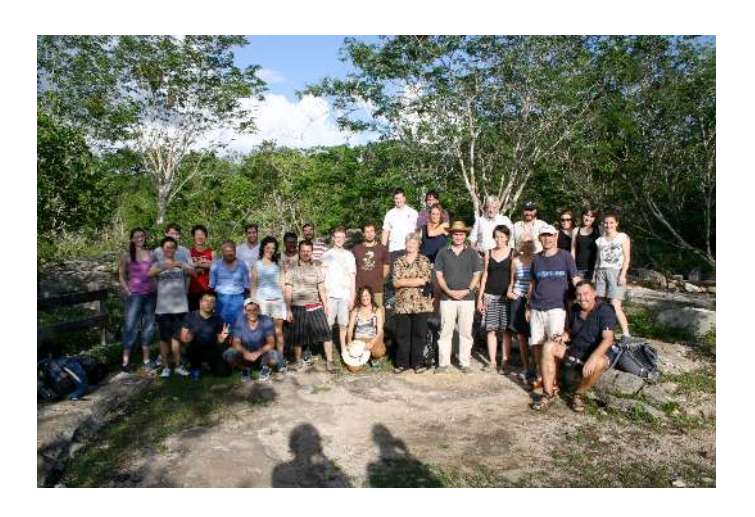
First IAGA school: Students and lectures during the field trip