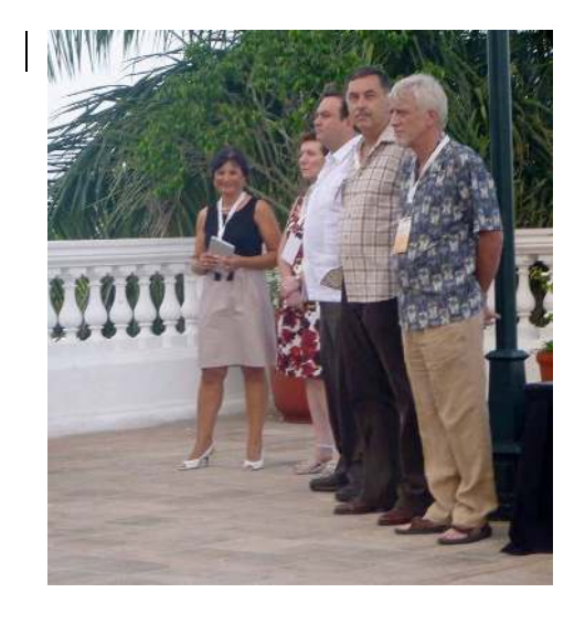
Opening and Award Ceremony