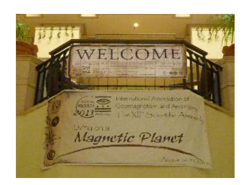
IAGA XII motto